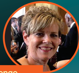
Dana Calonge Construction News